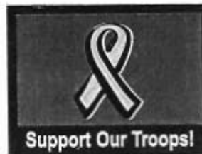
Support Our Troops!