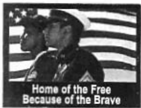
Home of the Free Because of the Brave

Hours: Monday-Friday 9am-5pm, Saturday 10am-4pm, Sunday Closed